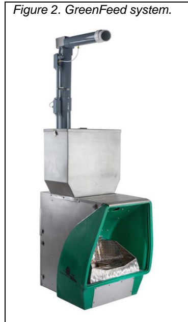
Figure 2. GreenFeed system.

The automated GreenFeed (GF) system (C-lock Inc., Rapid City, SD, USA) measures gas fluxes from individual animals when they voluntarily visit the equipment with the reward of a small quantity of pelleted feed as an incentive (Figure 2). Whilst feeding from the equipment, the air exhaled from the mouth and nostrils of the animal is aspirated, filtered, and then analysed in real-time by a non-dispersive infrared sensor, while the flow rate of the aspirated air is determined by a flowmeter.