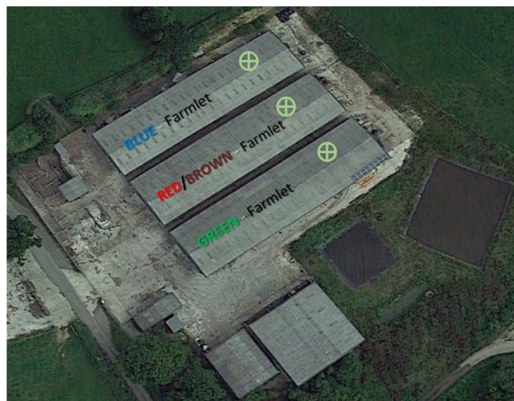
Figure 3. Locations of the GreenFeed systems in the cattle buildings.

There are seven GF systems in total on the NWFP, three of those used by cattle and four used by sheep during their respective housing period every year. The cattle GF units have been deployed since 2016 and are situated in each of the three dedicated farmlet cattle buildings [see NWFP_UG_Design_Develop.pdf , NWFP_UG_Livestock_Data.pdf ]. Following their weaning in the autumn, calves are allocated to one of the NWFP farmlet systems and are housed in the appropriate farmlet building where they can access their associated GF system (Figure 3). In the case of the Green and Blue farmlet cattle and, up until 2019, the Red farmlet cattle, this is typically from October to April when they are turned out to grass on their appropriate farmlet system. In 2019, the Red farmlet was converted to arable cropping and the cattle that would have been associated with that farmlet are from here on permanently housed in their associated building from weaning to slaughter. This represents a fourth system (Brown) for evaluation of indoor intensive finishing and cattle typically access the GF system from October to the following July.