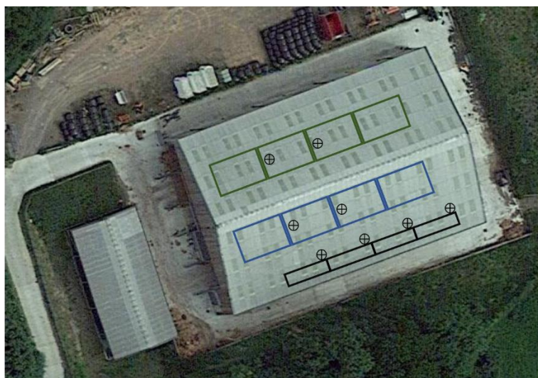
Figure 4. Potential locations of the GreenFeed systems in the Orr Small Ruminant Facility.

From 2019, sheep are no longer associated with the Red farmlet. The Green and Blue farmlet sheep are housed annually in the Orr Small Ruminant Facility (SRF) building from approximately the end of December until lambing time in the following mid-March-April whereafter they are turned out to grass on their allocated farmlet. Since 2022, the ewes have access to GF units, two for each farmlet, until lambing starts. If required, the four easily transported GF units can also be used for sheep housed in the biocontrol units in the SRF during feed intake trials (Figure 4).