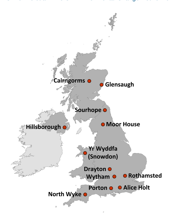
Figure 1. Locations of the ECN terrestrial sites.

load. The protocols are designed to ensure consistency in methods and data handling over time and across the ECN's sites. Sites were visited on the same day each week, preferably on a Wednesday, to synchronise sampling, within the site and across the network.