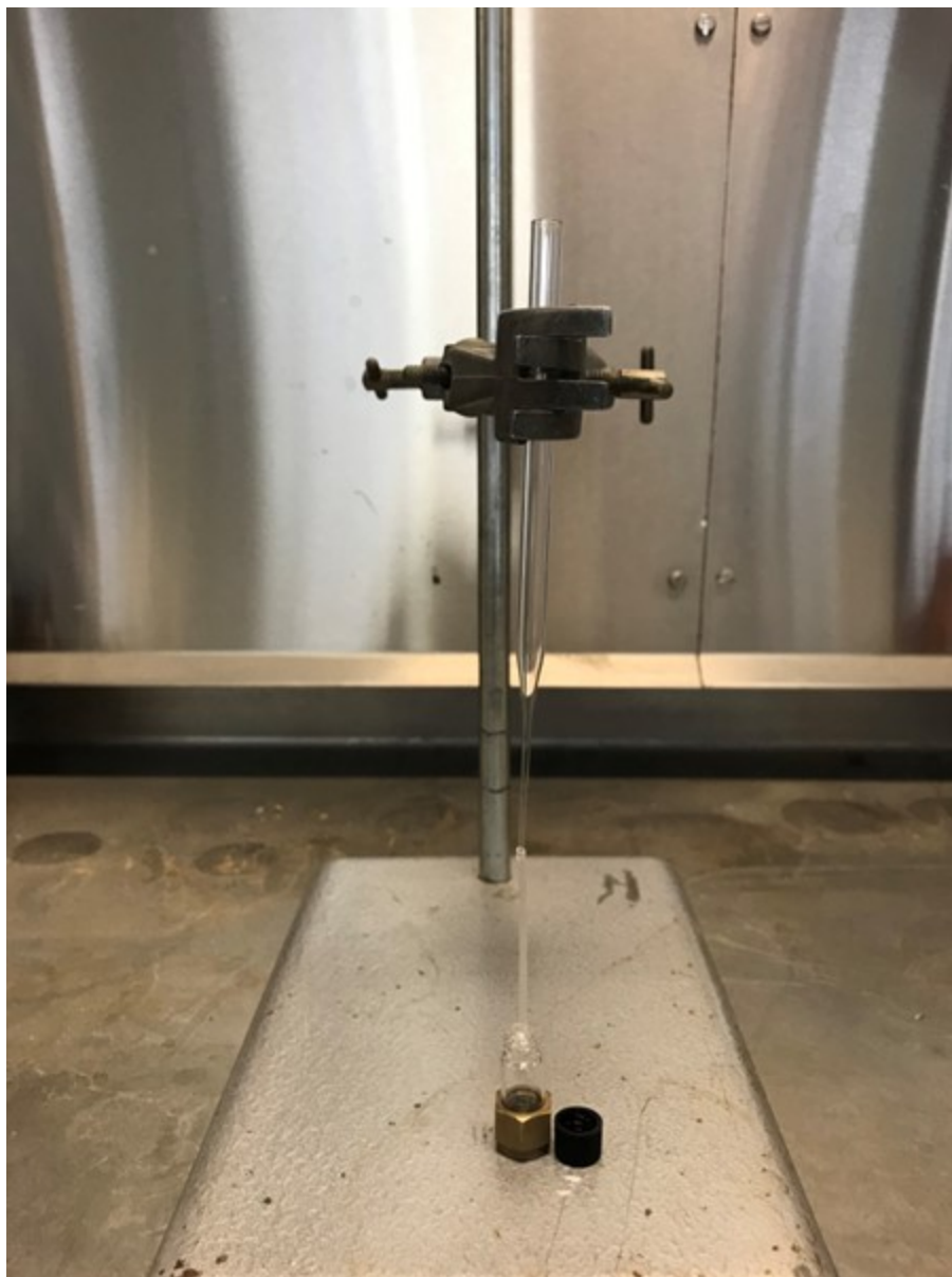
Set-up for eluting PDMS tube using Pasteur pipette