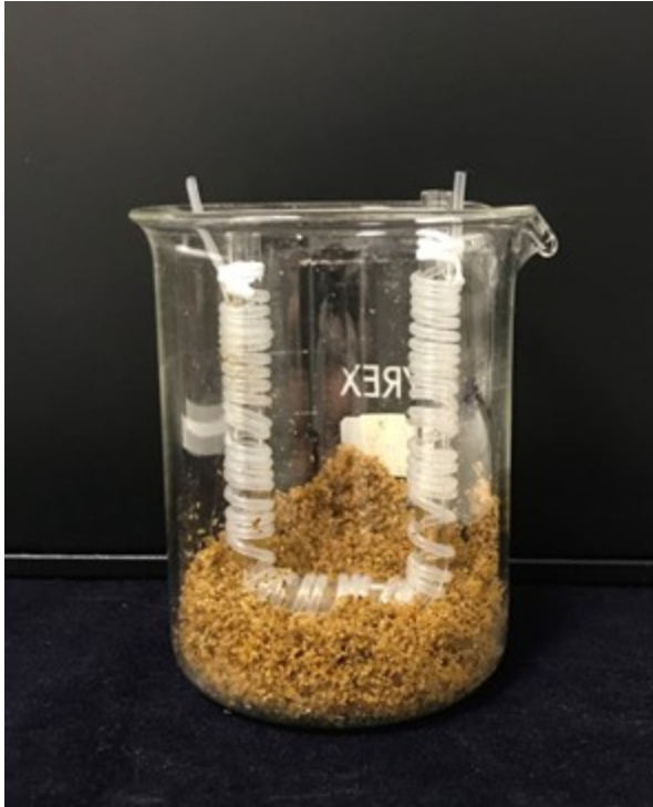
PDMS probe in sand.