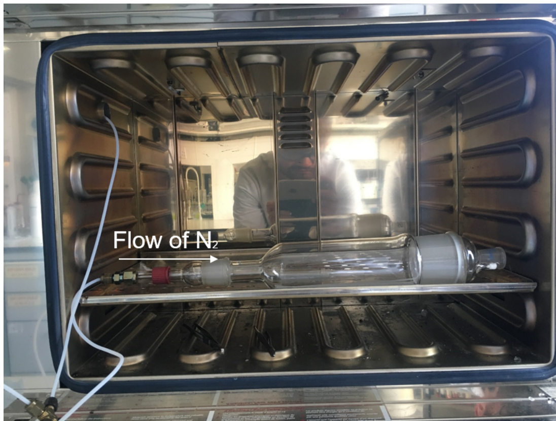
Modified heating oven containing glass vessel with pre-soaked PDMS tubing, under a constant stream of nitrogen.