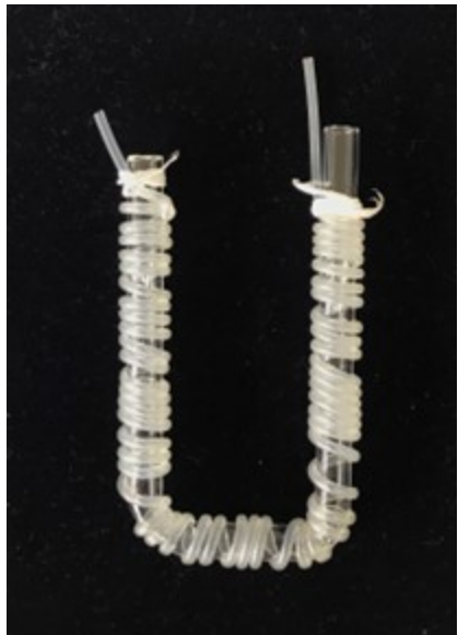
PDMS probe design: 130 cm of PDMS tubing coiled around a 19 cm hollow glass tube, bent into a U shape.

60 Place sand into the beaker to achieve a ca. 1 cm depth of substrate at the bottom of the beaker, and place the PDMS probe on top of the sand. Both ends of the tube should extend 1 cm beyond the rim of the beaker.