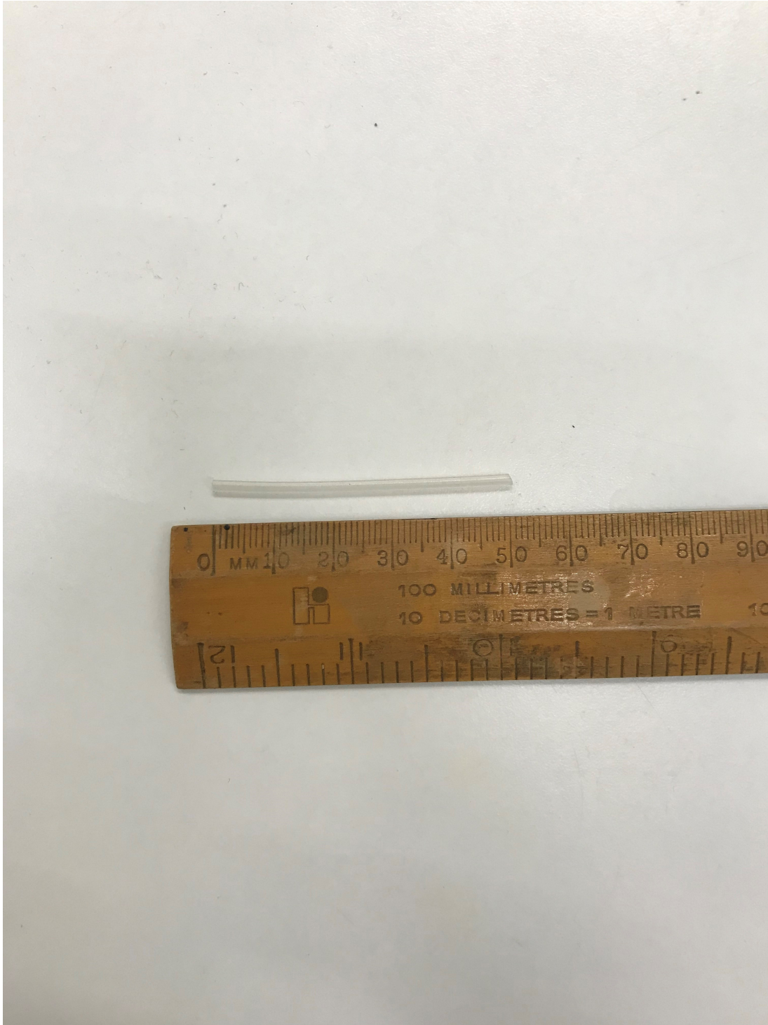
5 cm PDMS tube