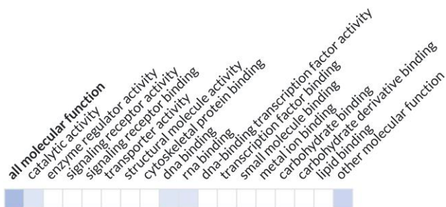
Fig. 3. Alliance ribbon view for the yeast RPB7 gene. High-level GO categories annotated are shown in shaded squares ( https://www.alliancegenome.org/gene/SGD:S000002812 ); darker shading indicates more annotations in that category.