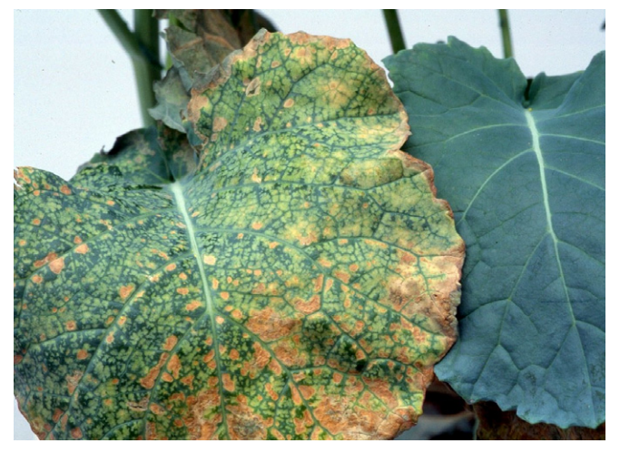
Fig. 3 Boron (B) deficiency (left) in Brassica napus . (Photograph credit: R. M. Norton, Image ID: IPNI2015RNO03-1274, copyright International Plant Nutrition Institute 2020).

A strong squad of boronologists then responded in detail to Lewis's Viewpoint (2019) in quick order: Wimmer et al. (2020; pp. 1232–1237) in this issue of New Phytologist. Their Letter is well reasoned, and it provides an excellent review of the evidence for the essentiality of B to plants. It is well organized into discrete sections that address each of the arguments in turn, and is also well referenced with all the key papers in the area. I find it an excellent contribution to the debate begun by the largely theoretical paper by Lewis (2019), and applaud the authors for putting together this valuable contribution to the arguments. They point out that B fulfils the first two criteria for essentiality and that it is the function in cell wall metabolism that is unambiguous and therefore fulfils