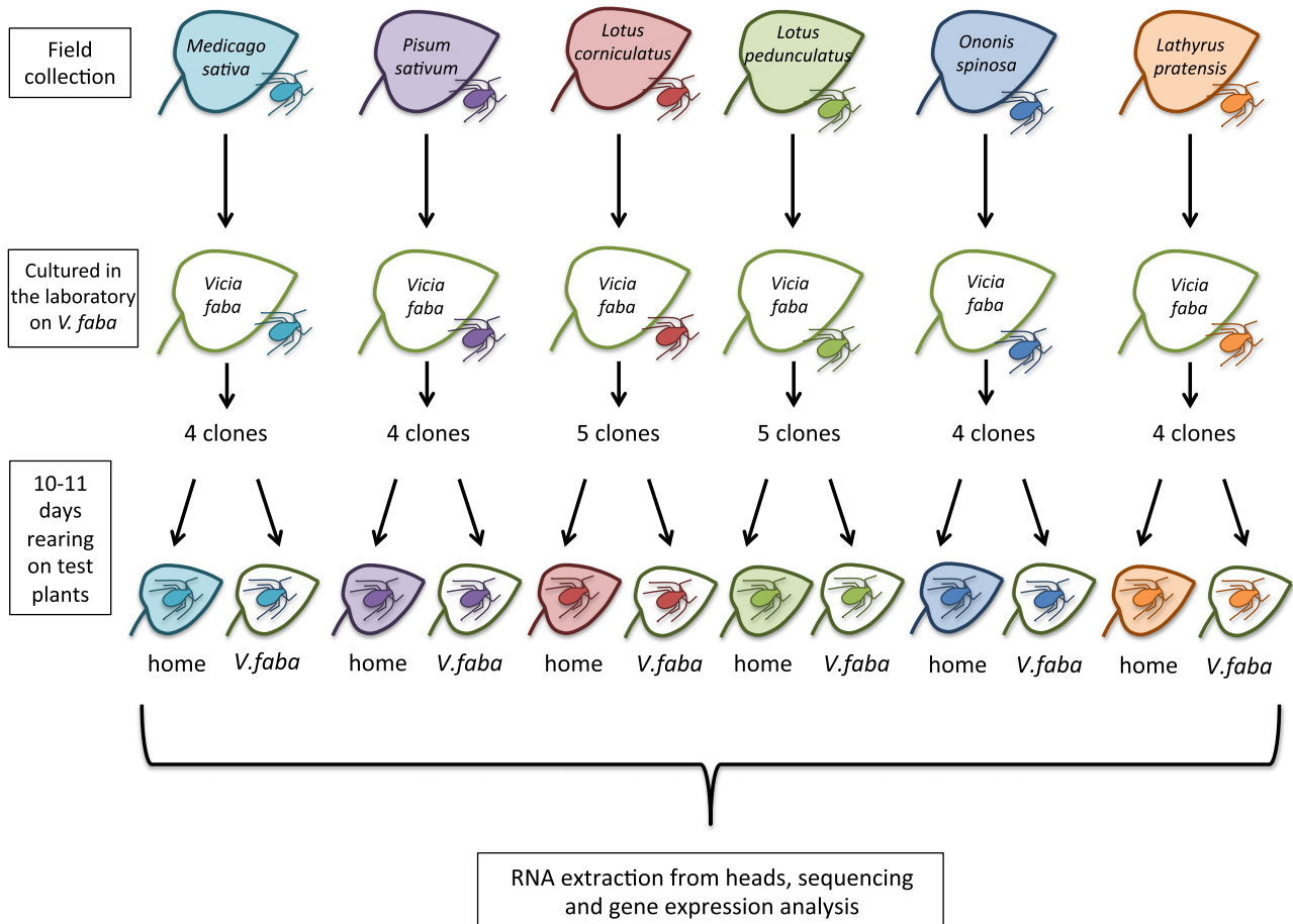
Fig. 1 Experimental design.

Gene Set corresponding to rRNA sequences (589) were excluded from further analysis, leaving 36 401 genes.