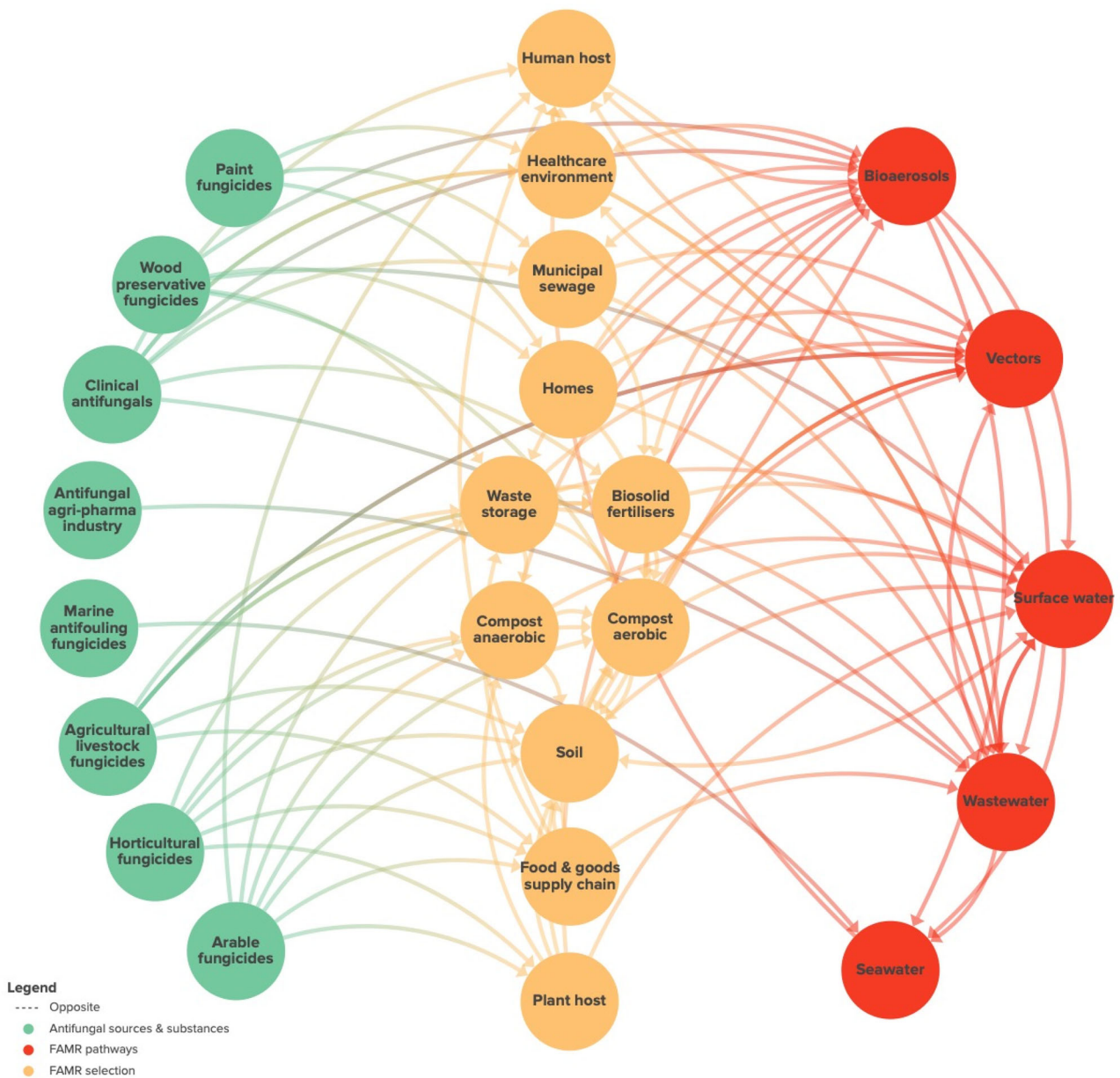
Fig. 1 | Potential hotspots of fAMR. A generic systems map scoping the potential for sources of antifungal chemicals (green) to interact with ecological compartments where selection and adaptation of fungi to antifungals can occur (orange) that then

lead to pathways of dispersal of viable fAMR inocula (red). The figure is generated from a kumu project where it can be dynamically browsed at https://kumu.io/mcfisher/famr-antifungal-sources-pathways-and-vectors .