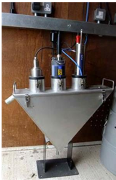
Figure 5. By-pass flow cell.

The level data is processed by the netDL logger, and a signal sent to the PLC according to the following conditions: