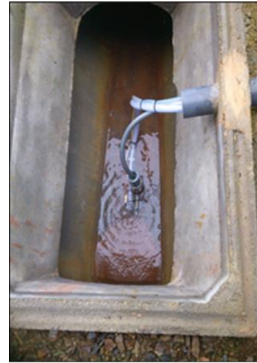
Figure 4. Water sampling point in conduit.

The cycle of filling and emptying the flow cell continues whilst flow conditions allow, but when flow drops below a critical threshold the pumping cycle stops and the volume of water in the flow cell is retained, thus keeping the sensors submerged. The pumping cycle is controlled through a combination of the data from the level sensor, a netDL 1000 data logger [OTT Hydromet, Loveland, CO., USA], a programmable logic controller (PLC) [PLC LOGO, Siemens AG, Munich, Germany] and a bi-directional peristaltic pump [621VIR, Watson-Marlow Inc., Massachusetts, USA]. The PLC stores a programme that activates the pump as well as controlling its speed and direction via a 4-20 mA connection.