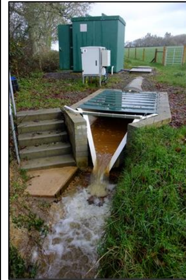
Figure 2. Example of an H-Flume with associated flume cabin.