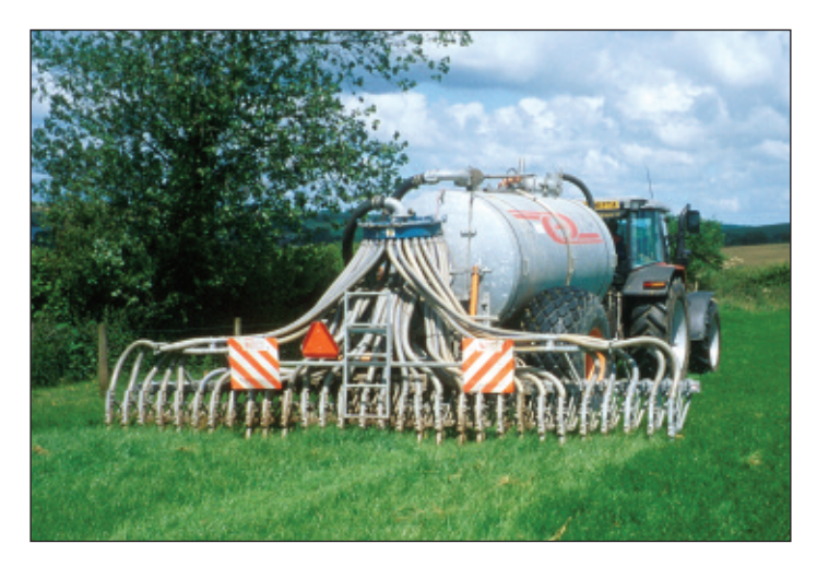
Fig 10.1 Slurry application to the soil surface using trailing shoe equipment

Livestock intensification, dependent on inorganic fertilisers, has reduced the use of manures as nutrient sources. Consequently, manures (and other organic resources) became a disposal problem. However, this perception of 'waste disposal' is changing towards one of nutrient and organic matter management, because of the need to focus on environmental issues and to reduce input costs. Increased European