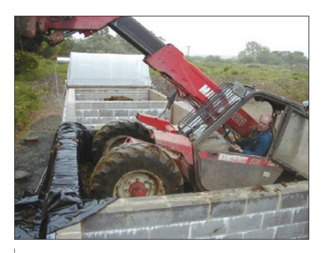
Fig 10.4 Compaction of solid manure heaps to maintain anaerobic conditions

Maintaining anaerobic conditions in the FYM heaps, e.g., by compaction (Figure 10.4) can reduce those