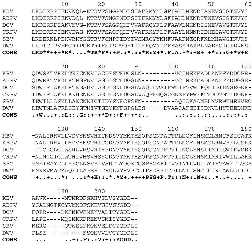
Figure 1. Alignment of KBV ABPV, DCV, CRPV, SBV and DWV amino acid sequences matching in the putative RNA polymerase RNA dependent domain. The Genbank references are: NP851403 (KBV), NP066241 (ABPV), NP044945 (DCV), NP647481 (CRPV), AAL79021 (SBV). The consensus sequence (Cons.) is shown below the sequences in bold characters.

several approaches were used. First, the sequences of the primers were matched against nucleotide databases and were found to be specific to the DWV sequence. Second, we tested the primers for their capacity to detect other bee viruses. No PCR products were produced by these primers from samples known to contain KBV, ABPV, CBPV, BQCV, or SBV. Finally, the 395 nucleotide PCR products from five isolates collected from different places in France were sequenced and were found to be identical to the DWV sequence.