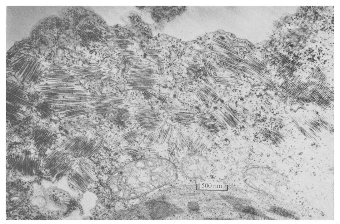
Fig. 2. Cytoplasm of tobacco plant cell infected with PMTV showing a large area with virus particles.