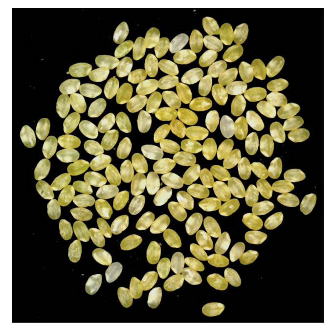
Figure 2. Golden rice. Milled rice is deficient in important nutrients, causing serious public health problems among people in many countries of Africa, Asia, and Latin America, who rely exclusively on rice as their staple food. The introduction of a combination of transgenes into rice enabled the transgenic rice plants to synthesize \beta -carotene, the precursor to vitamin A. Although plants synthesize \beta -carotene in other tissues, it is not normally made in the endosperm, so "golden rice" could not have been produced with traditional breeding techniques.

combined in transgenic rice, and some stable lines with yellow endosperms were produced. Biochemical analysis confirmed that the color was due to provitamin A. This was present in sufficient amounts such that a typical Asian rice diet using these lines would provide the daily requirement.