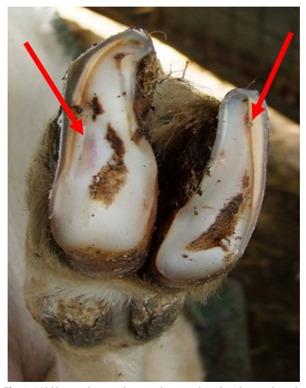
Fig. 2 Mild lesion showing haemorrhage in the white line or the sole area of the foot ( see arrows )