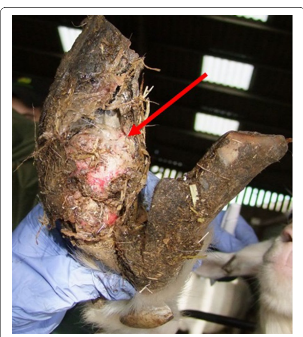
Fig. 5 Extreme lesion showing only the wall horn of the foot remaining, leaving a large area of necrotic tissue with no healthy corium visible ( see arrow )