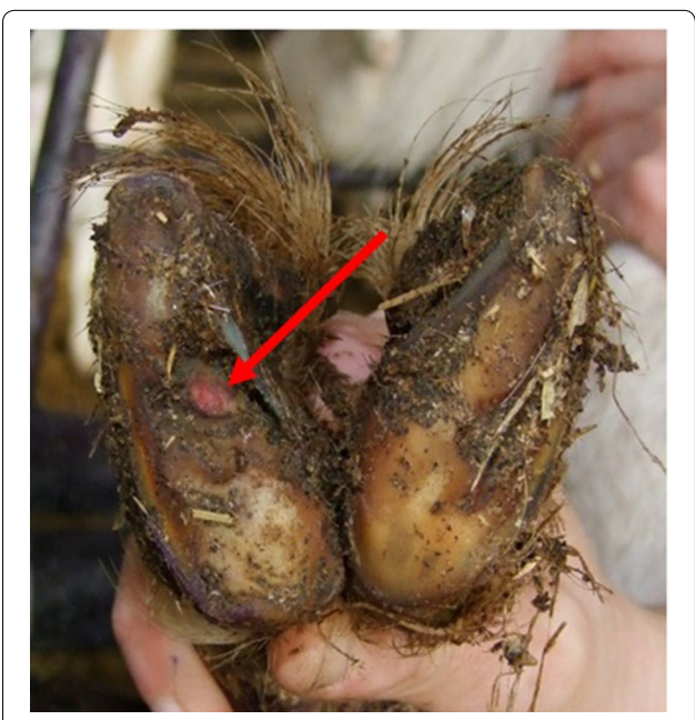
Fig. 3 Moderate lesion showing a small area of corium exposed in the sole horn ( see arrow )