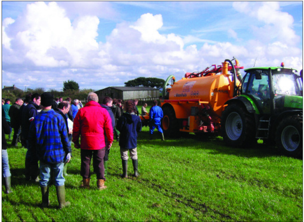
Figure 10.4 Best practice for slurry management in Nitrate Vulnerable Zones was the topic of the day at a workshop held at Trink Farm near St Ives in October 2005, organised jointly by FWAG and Grassland Challenge

Conclusions: Factors contributing to the success of this beef system, as demonstrated at open days and national beef events, included use of moderate levels of N fertiliser and composted FYM, setting and monitoring target growth rates for each production phase, using grazing management guidelines based on sward height to control pasture quality and using supplementary feed when necessary for housed cattle to ensure targets were met.