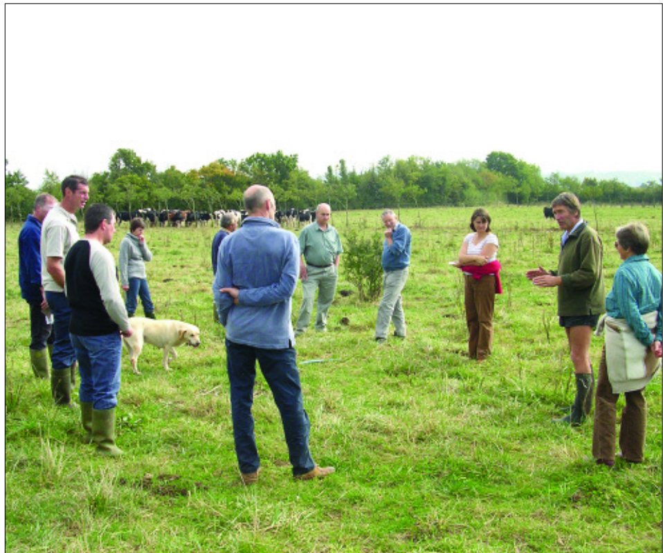
Figure 10.6 Grassland management features highly at Focus Group meetings

The aim is to expand into the rest of the South West of England through Duchy College's link with the South West of