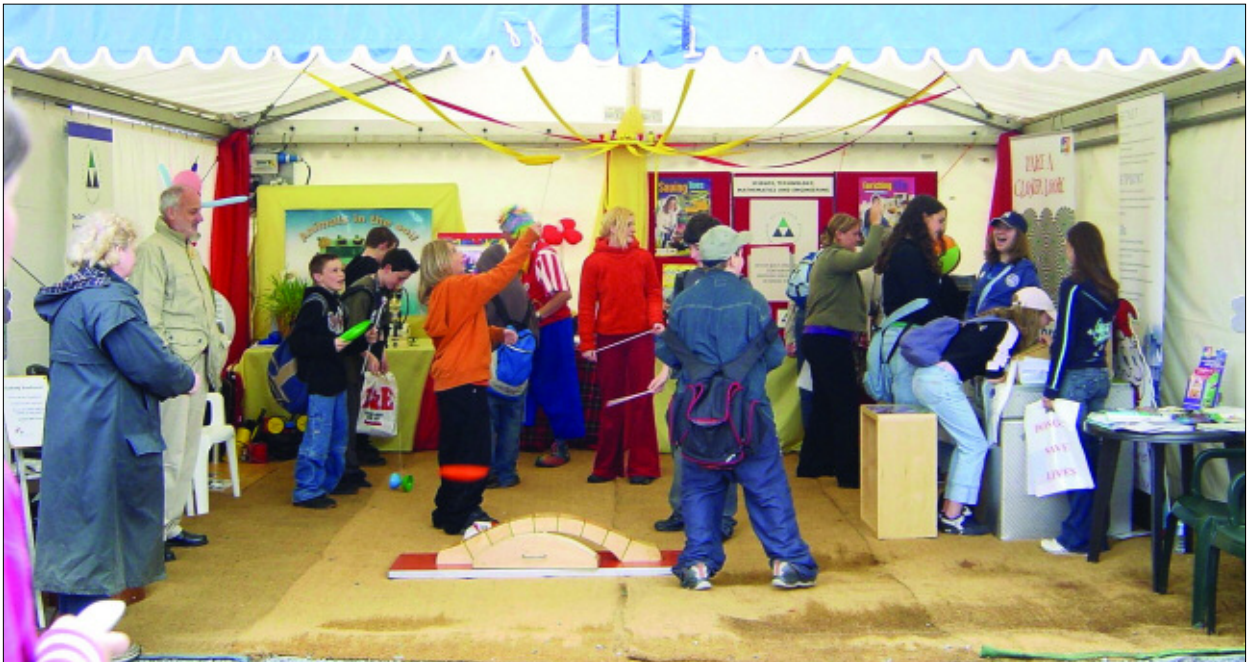
Figure 10.7 Science 'WithInTent' at the Devon County Show