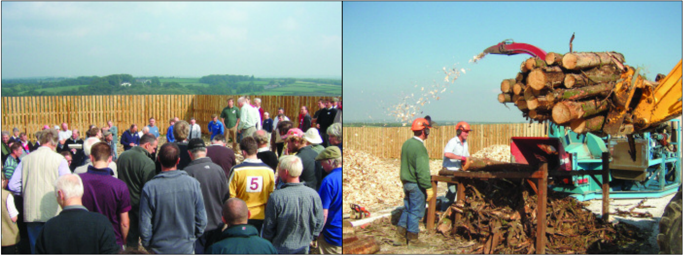
Figure 10.5 The Woodchip Corral Event brought together contractors, researchers, practitioners and the Environment Agency to discuss current understanding and research priorities and attracted 200 farmers

a strictly commercial setting and is very much based on a particular group's discussions and priorities (Figures 10.4, 10.5 and 10.6). The main activities are determined by the Grassland Challenge Steering Committee formed from the Grassland Societies.