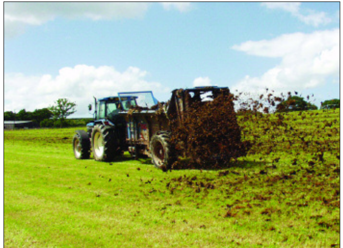
Figure 10.2 Applying farmyard manure following a silage cut

Fertilisers and manuring: Small applications of fertiliser were made at the start of the grazing season (around 60 kg N per ha). Composted farmyard manure was applied to the pasture in August following 2nd cut silage (Figure 10.2). Composting was achieved by turning the manure with a fore-loader on two occasions in the month following mucking-out of the cattle yards (Figure 10.3). This