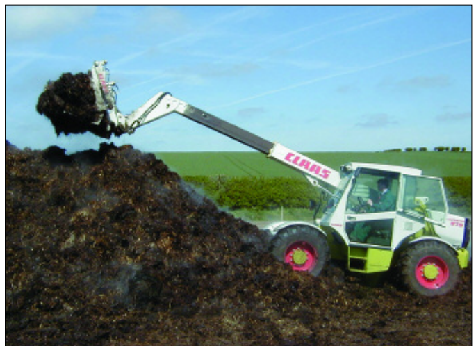
Figure 10.3 Turning manure with a fore-loader

resulted in relatively dry, friable material that was incorporated into the sward quickly, particularly manure which was stored under cover. The heifers were allowed to graze these areas, in addition to untreated areas, approximately 5-6 weeks after spreading.