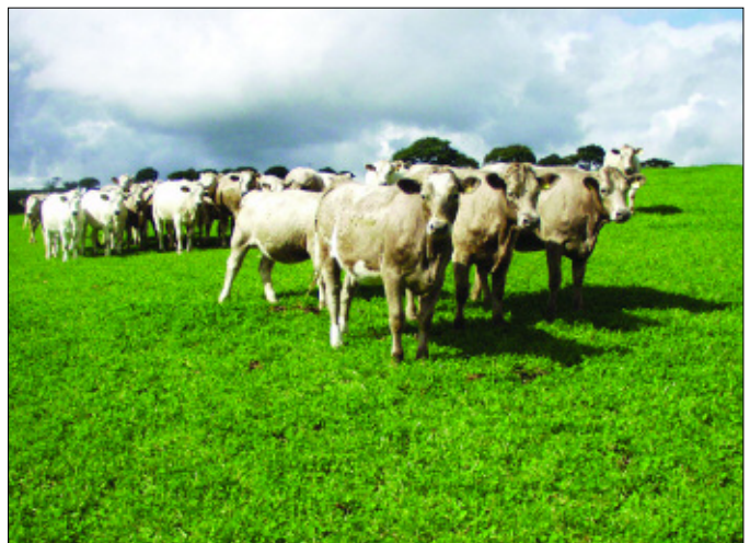
Figure 10.1 Charolais x Holstein heifer calves

We also get involved increasingly in projects with farming groups and other stakeholders in an interactive way as illustrated in sections 2 and 3.