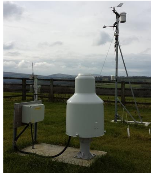
Figure 2. Dedicated Meteorological Instruments.

Live data (and some summary statistics) are available in the link below. However, it should be noted that these data have not been through the QC process.