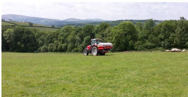
Figure 2. Inorganic fertilizer spreading using a fertiliser spinner.

Low soil pH is rectified by using prilled lime products which are applied accurately with the same fertiliser spinner. Standard lime is used where a large step change in soil pH is required, such as that for the grassland to arable conversion of the Red farmlet.