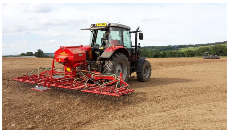
Figure 4. Drilling the seedbed using a grass seeder.

The seedbed is rolled again to improve the contact between the seed and the soil. All these details, including the type and quantity of seed used is recorded. An animation of the timing of reseeded events of the farmlets can be found on the NWFP webpages.