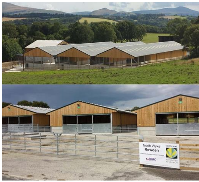
Figure 3. Dedicated livestock buildings.

Since 2019, FYM from the permanently housed cattle (Brown farmlet or system) is no longer applied to the NWFP; previously this would have been applied to the Red farmlet which no longer receives FYM input since conversion to arable.