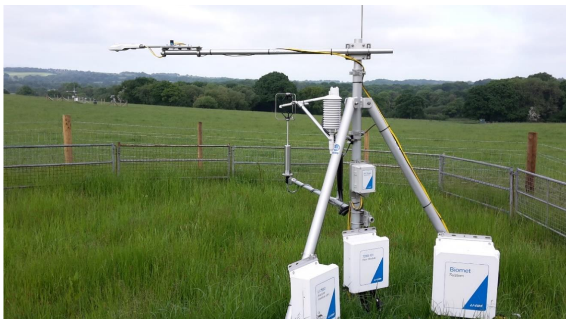
Figure 2. Eddy Covariance tower and monitoring equipment.

As wind direction is predominantly West or Southwest all are positioned to the Northeast to maximise the time the towers are measuring from the field; their precise location is given in Appendix A. The EC towers and associated sensors are kept within fenced enclosures (approximately 8 \text{ m}^2 ) within the fields, to protect them from being damaged by livestock (Figure 2). From January 2017 to June 2019, the analysers were approximately 1.6 m above the canopy (i.e., grass or crop) height. In July 2019, they were raised to approximately 2.6 m above canopy height. This was in order to increase the proportion of the field being measured.