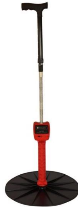
Figure 2. Jenquip EC20 Rising Plate Meter

The meter estimates the available forage for livestock grazing and helps determine when to move livestock to fresh grazing areas, thus optimising forage utilisation and ensuring sustainable pasture management. The meter is placed or 'plonked' on the ground, and at each 'plonk' the circular plate rises creating a slight compression of the herbage material that is supporting it underneath, and thus a measure of usable forage height. Metal divots spaced at 0.5 cm intervals up the stem of the meter provide a 'click' at each point that register the changes in height of the plate above the ground. The height readings are automatically converted to forage dry matter (DM) values within the Pastureprobe app using the calibration equation: