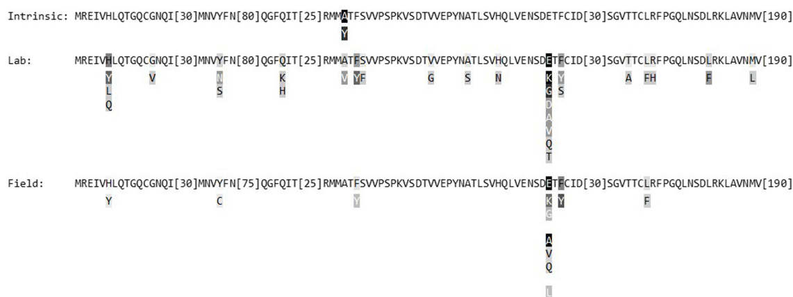
FIGURE 1 | Summary of key \beta -tubulin amino acid substitutions in intrinsically resistant fungal species, and resistant laboratory mutants and field isolates of other fungal species. Top lines: wild-type consensus sequence; darker shading indicates residues at which substitutions occur in more species. Square brackets: omitted residues (no substitutions). Letters under sequences: substituting amino acids in resistant mutants/isolates; darker shading indicates substitutions occurring in more species.

mutations due to stronger positive selection by fungicides, or due to reporting bias since highly resistant isolates are more likely to result in control failures prompting further investigation.