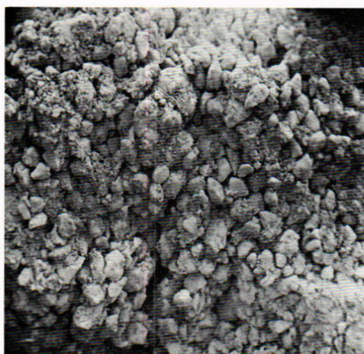
(a) Barnfield, Rothamsted.