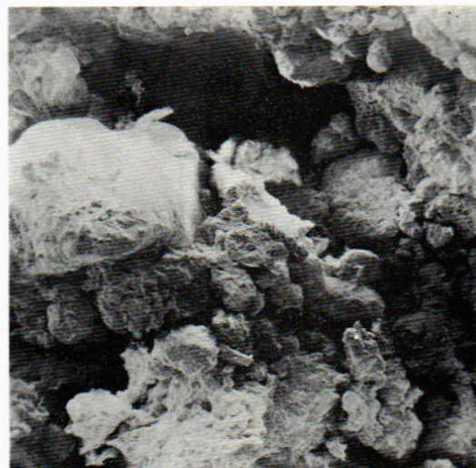
PLATE 2. Scanning electron micrographs of soil 'cap' on Barnfield, Rothamsted (June 1973) ( \times 240 ). Top. Surface of 'cap'. Bottom. Lateral view just below 'cap'.