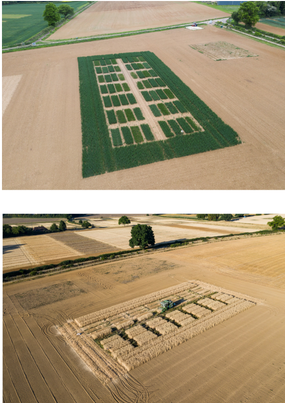
Fig. 2. Drone pictures of the 2021–2022 field-trial, showing the layout of 56 plots of genome edited (Cadenza background) and TILLING mutant lines (Claire background) with respective controls, in a randomized block design. The plots were surrounded by a pollen barrier of Cadenza wheat and a 20m clear zone. The upper image shows the vegetative growth phase (May 2022) and the lower image the harvest (August 2022).